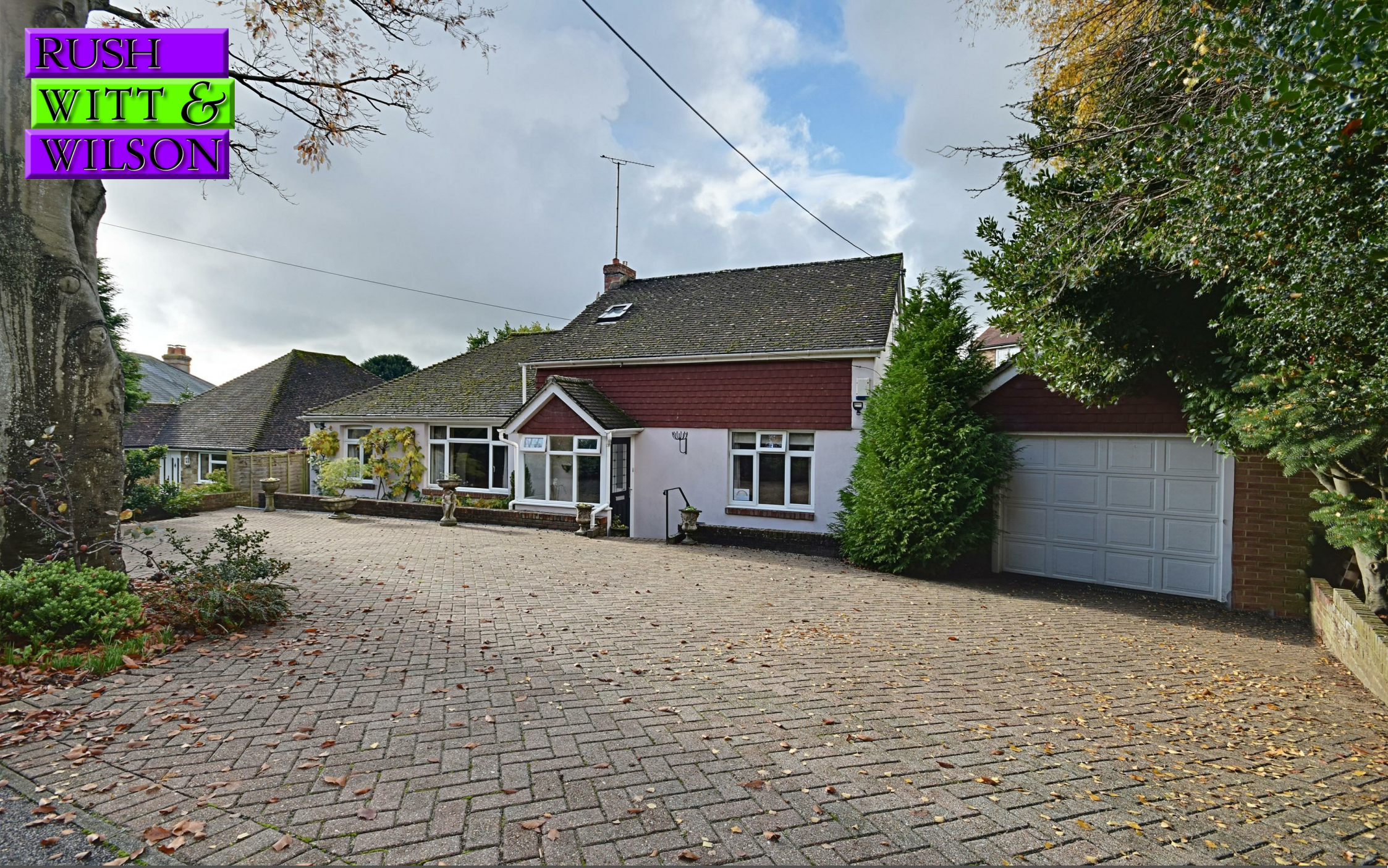
Byways Cottage Church Lane, Battle, East Sussex TN33 9DR £435,000